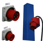
Electrical power connection (A)