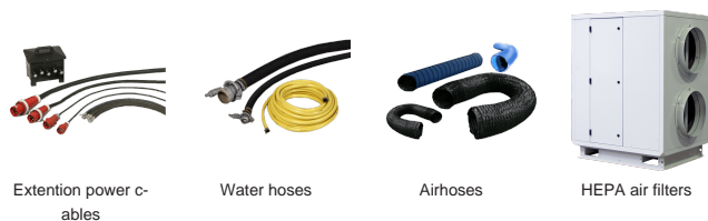
Extension power cables