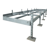
Elevation on brackets