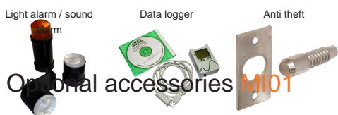
Light alarm / sound