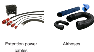
Extention power cables